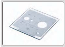
calibration plate (included)