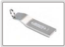
16G USB flash disk (included)